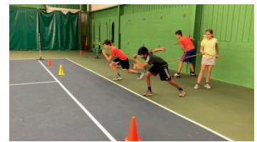
Private Sessions for Youth Available by Appointment