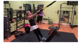
Private Sessions for Adults Available by Appointment

SIGN UP FOR AGILITY AT THE FRONT DESK OR BY TEXT (330) 612-5229